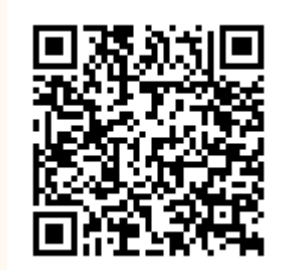
Scan to Verify